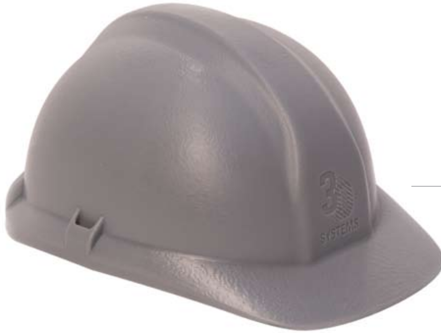
Functional prototype helmet used for durability testing

Get extreme performance and durability with Accura ® Xtreme Plastic.